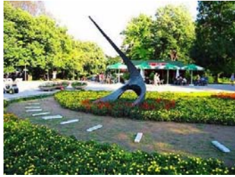
The Sea Garden – a wonderful place to enjoy magnificent sea views